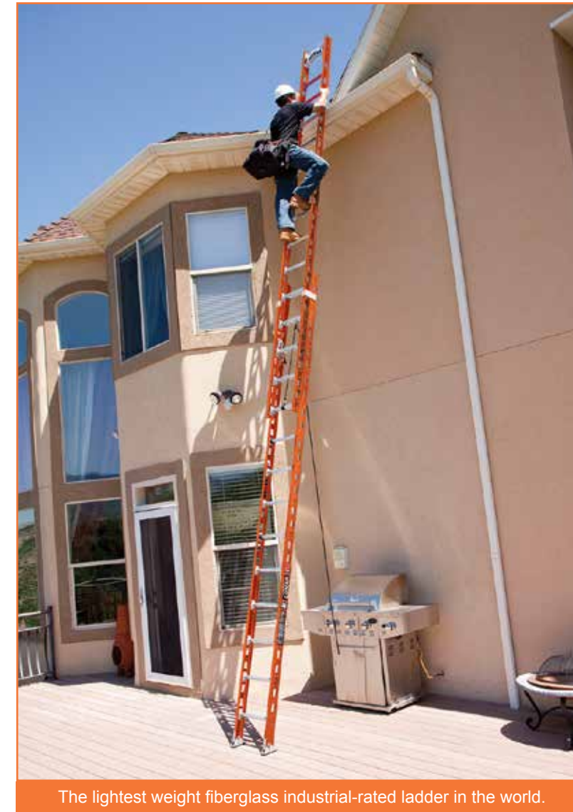
The lightest weight fiberglass industrial-rated ladder in the world.